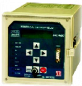
Numerical Over Current Relay with Communication