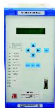
Synchro Check Relay