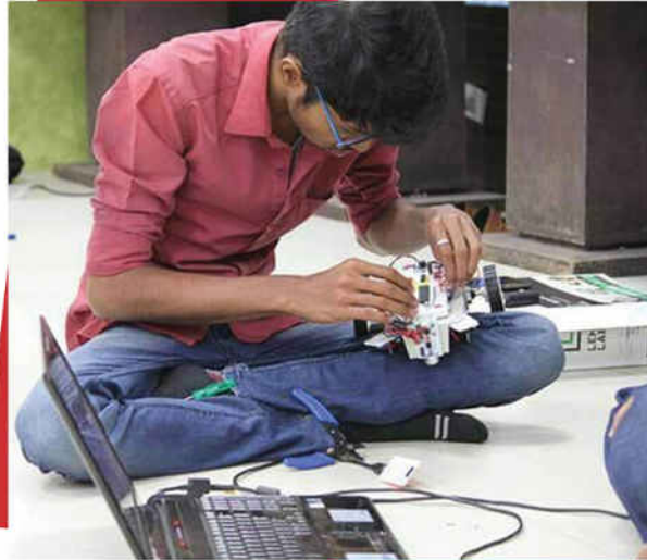
Student involved in the construction of Robot