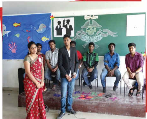
IV ECE students organized shipwreck event for other college participants.