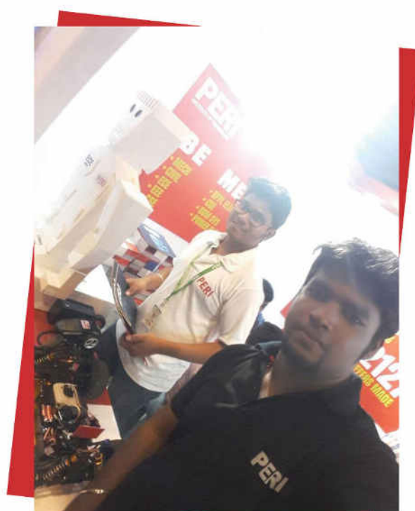
Students interacting with the Robot