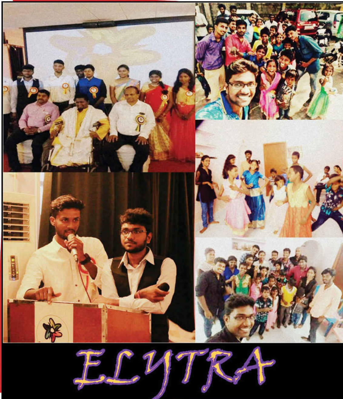
Elytra Inauguration and Events

Our final & third year ECE students involved in social activities to help uplift the morale of under privileged kids by organizing events to encourage and motivate them, by taking them to places which every kid would love to go, by conducting free medical camps to enhance their health etc.”